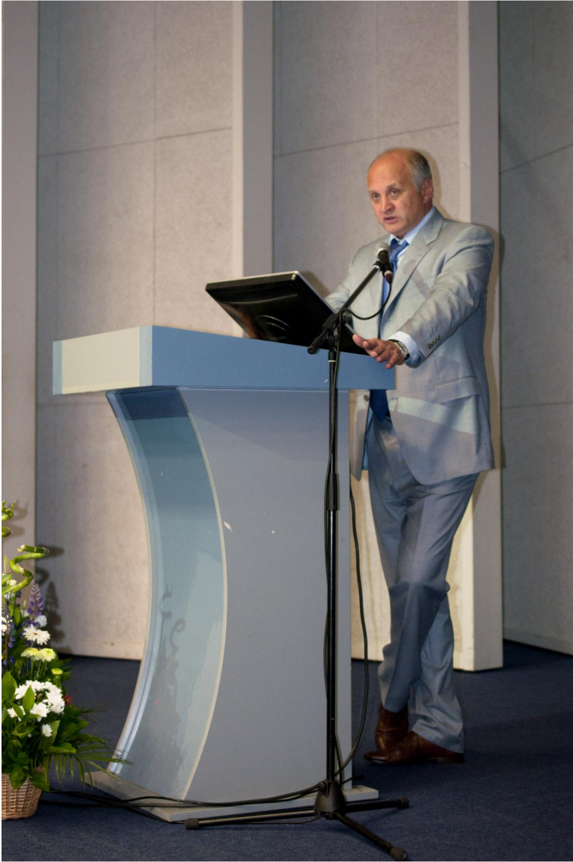
Fig. 7. Speaker Prof. A.Y. Usenko (Ukraine).