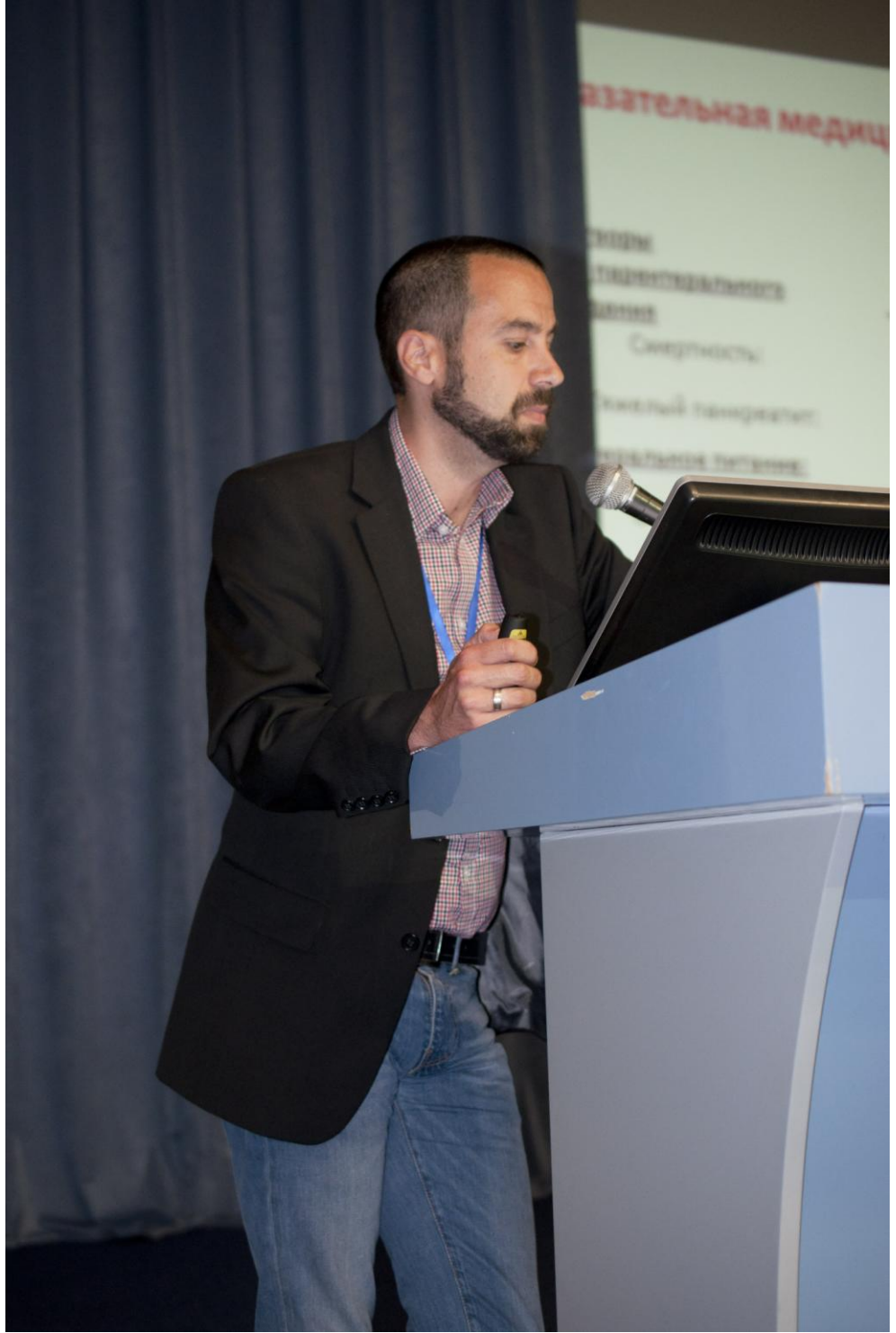
Fig. 5. On the treatment of chronic pancreatitis reports Prof. A. Szucs (Hungary)