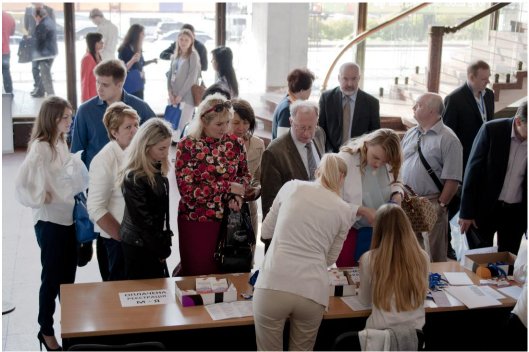
Fig. 1. May 26, 8: 00. Registration begins.