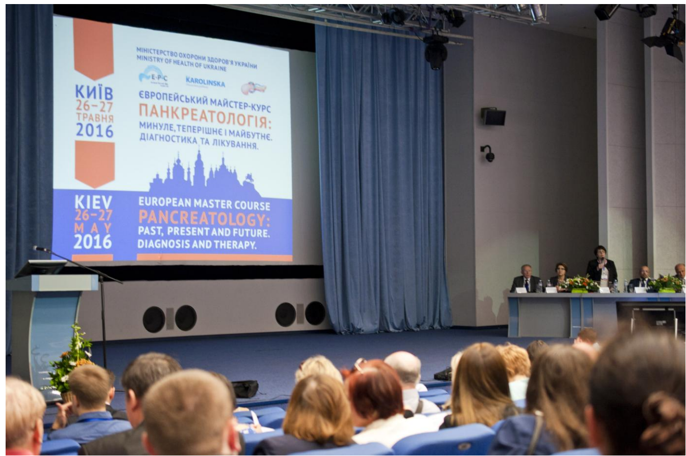
Fig. 2. Opening of the Master Course.